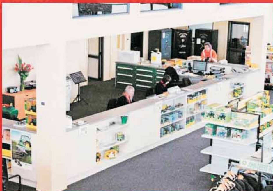
Lunds Joinery made the large service desk for Drummond & Etheridge's new premises in Rolleston.

This year the Lunds team provided cabinetry and other joinery for a number of high-end houses. This included a stained American white