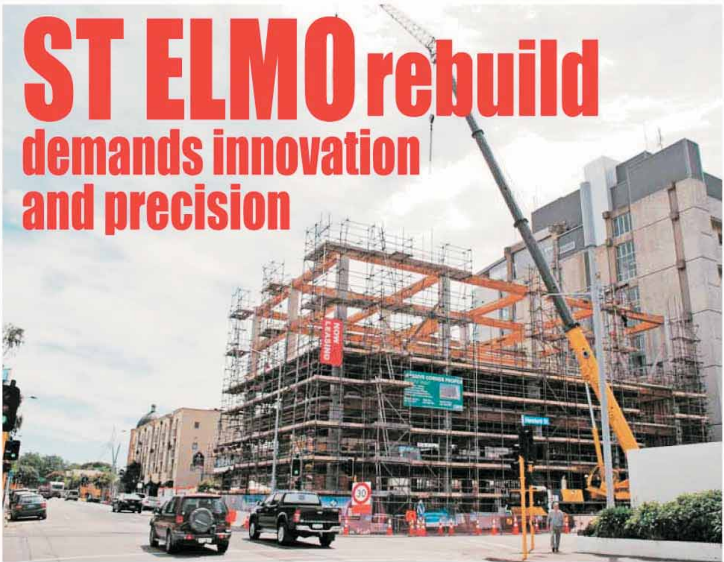
The new building features a unique structure of precast concrete columns and post-tensioned LVL beams.

A building with a pioneering approach to seismic strengthening has presented some unique challenges both to the C. Lund & Son engineers and builders who are constructing it and to the Australian manufacturer who provided the specialised timber beams that are at its heart.