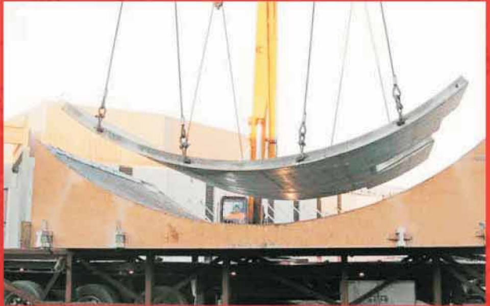
The curved pre-cast panel C Lund & Son provided for the Hub shopping mall in Hornby.