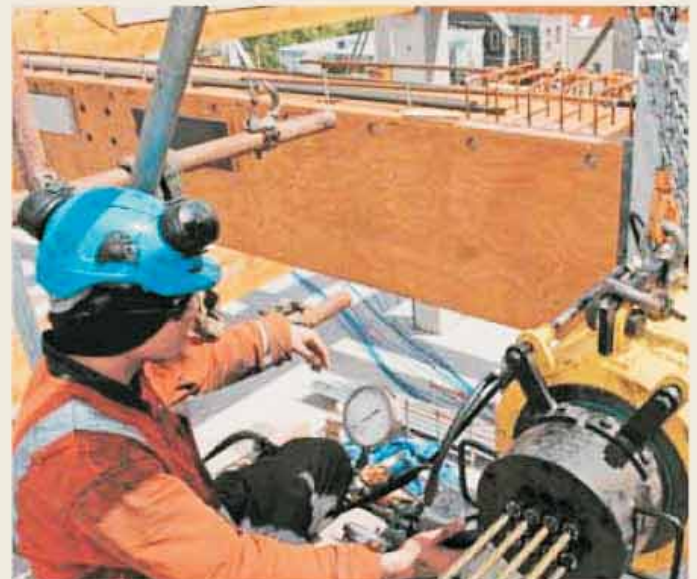
A specialist team from Fulton Hogan post-tensions the LVL beams.