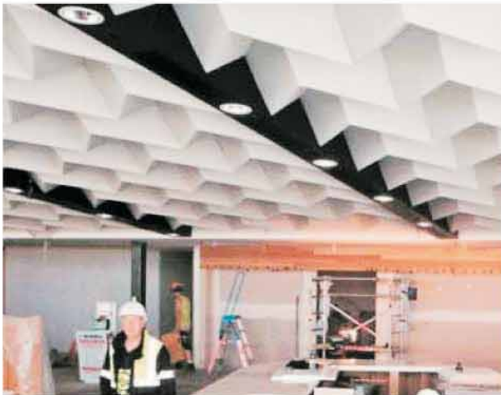
When Mainzeal stopped trading C Lund & Son was under contract to provide the decorative ceiling for the Air NZ Koru Lounge at Christchurch Airport.