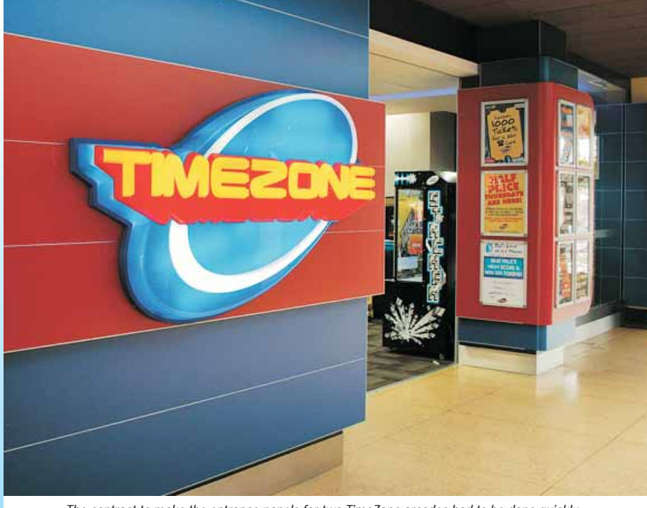
The contract to make the entrance panels for two TimeZone arcades had to be done quickly.