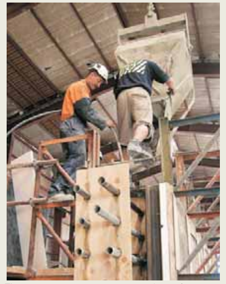
The precast team pours concrete into a form

Inside the 17m high precast shed are two precasting operations. One is a heated steel bed for flat panels, and