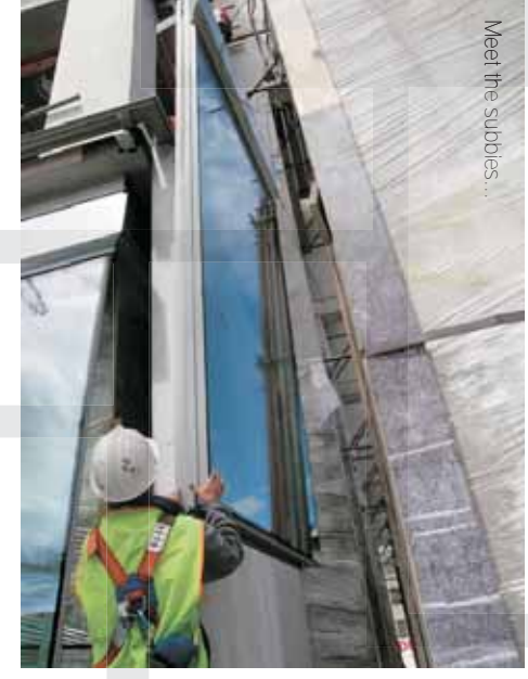
The Thermosash crew install a double-glazed glass wall unit.

"We are very impressed with Andrew Macgregor and the attention to detail Lunds has shown on this project. The quality of the precast and the construction and the accuracy of the construction tolerances for a building this size is some