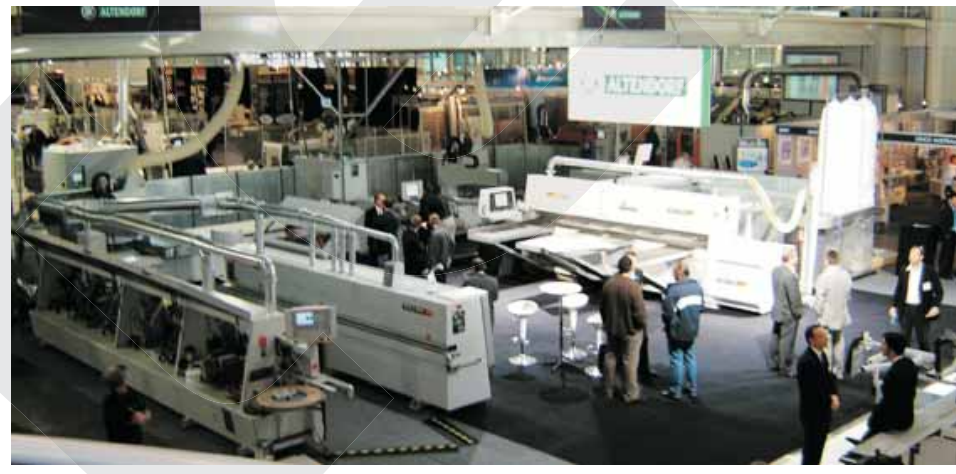
The AWISA trade show is a great place to check out the latest joinery technology.

"We also looked at vacuum lifters for lifting solid core doors, etc. There were